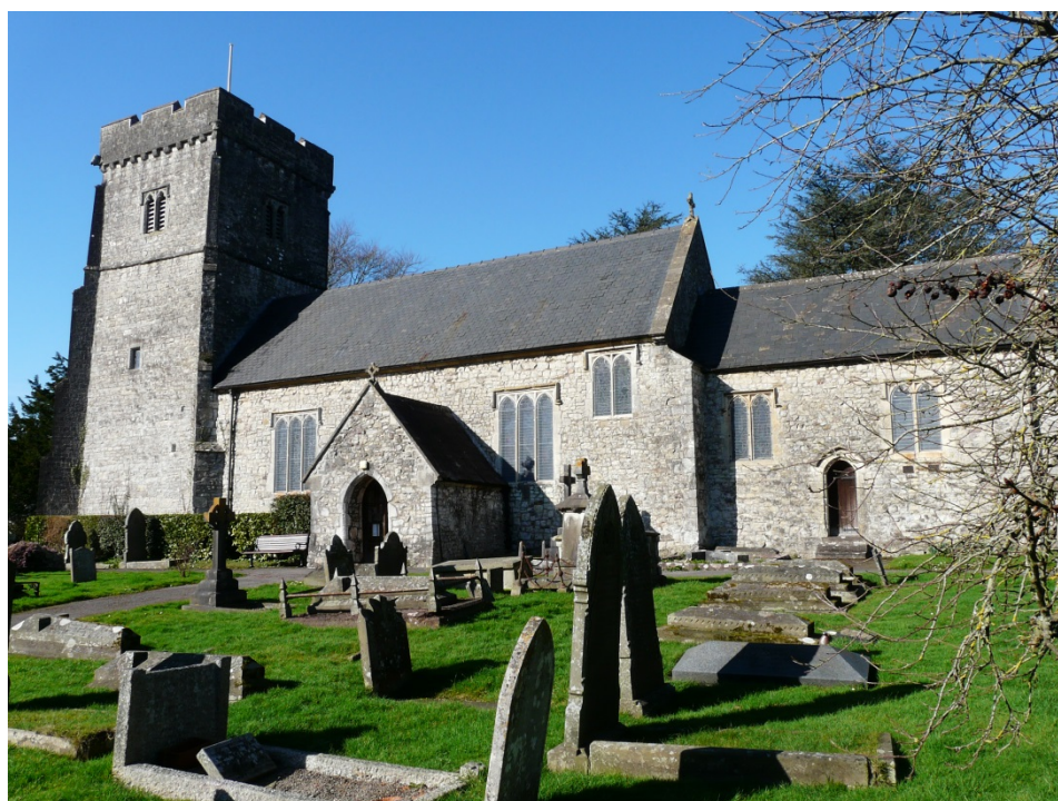
St. Peter's Church